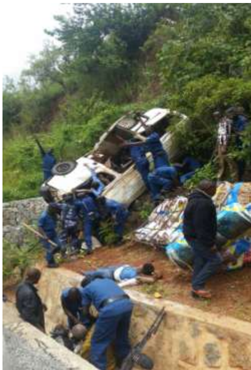
Police agents intervene after the fatal accident

This is not the first time that motorists are victims of accidents because of the convoys of some Burundian officials. Some of these victims were beaten and accused of wanting to kill the lives of these authorities; as was the case for a bus driver violently beaten on the public highway by police agents from the custody of the Burundian Minister of Public Security on July 14, 2016 (see Sos-Torture Burundi report No. 31 : http://sostortureburundi.org/wp-content/uploads/2016/10/SOS-TORTURE-BURUNDI-RAPPORT-N%C2%B031.pdf ). This recklessness on the roads denotes a fear and a panic of Burundian officials who no longer travel without convoys of heavily armed police and ignoring other motorists on public roads.