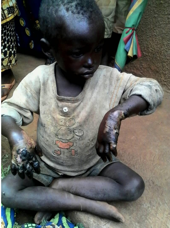
Young boy burned to death in Busoni

in the medical care of the victim, while waiting for the court to rule on the perpetrator of this child crime.