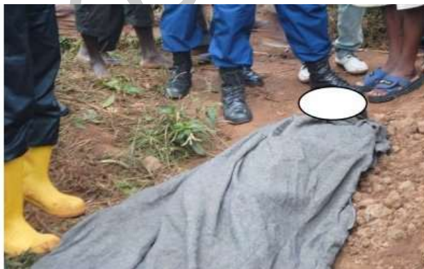
The unidentified victim discovered in Giheta

- Unidentified individuals murdered a man whose body was found on Masasu Hill, Giheta commune, Gitega province (center of the country) on 27 September 2017. The victim and the alleged murderers were not identified that day.