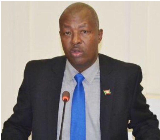
M. Emmanuel Niyonkuru, Ministre of water, Environment and urban planning killed in front of his domicile