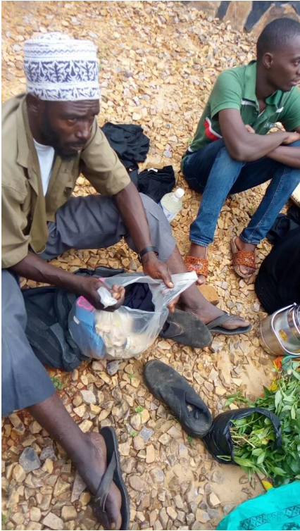
Some of those arrested by the police in Rumonge

- Police agents arrested at least ninety (90) persons in Gasanda district, Ruyigi commune and province (East of the country) on January 13, 2018 in the evening. Witnesses report that these persons are members of the Marial movement where worshipers meet for prayers and fraternity.