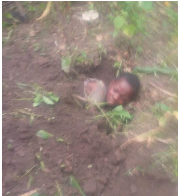
One of the young children buried living in Nyamabere